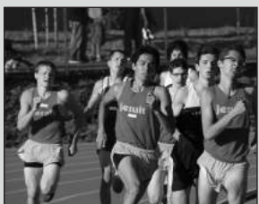
TRACK & FIELD

UPGRADING OUR STADIUM TO SUPPORT ALL OF THE FOLLOWING ATHLETIC PROGRAMS AT JESUIT: