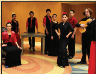
Tierra Adentro de Nuevo Mexico