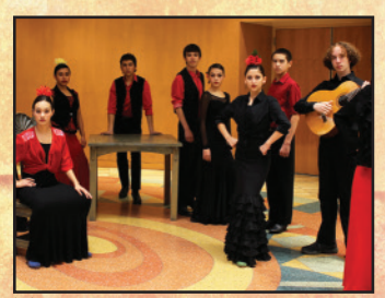
Tierra Adentro de Nuevo Mexico