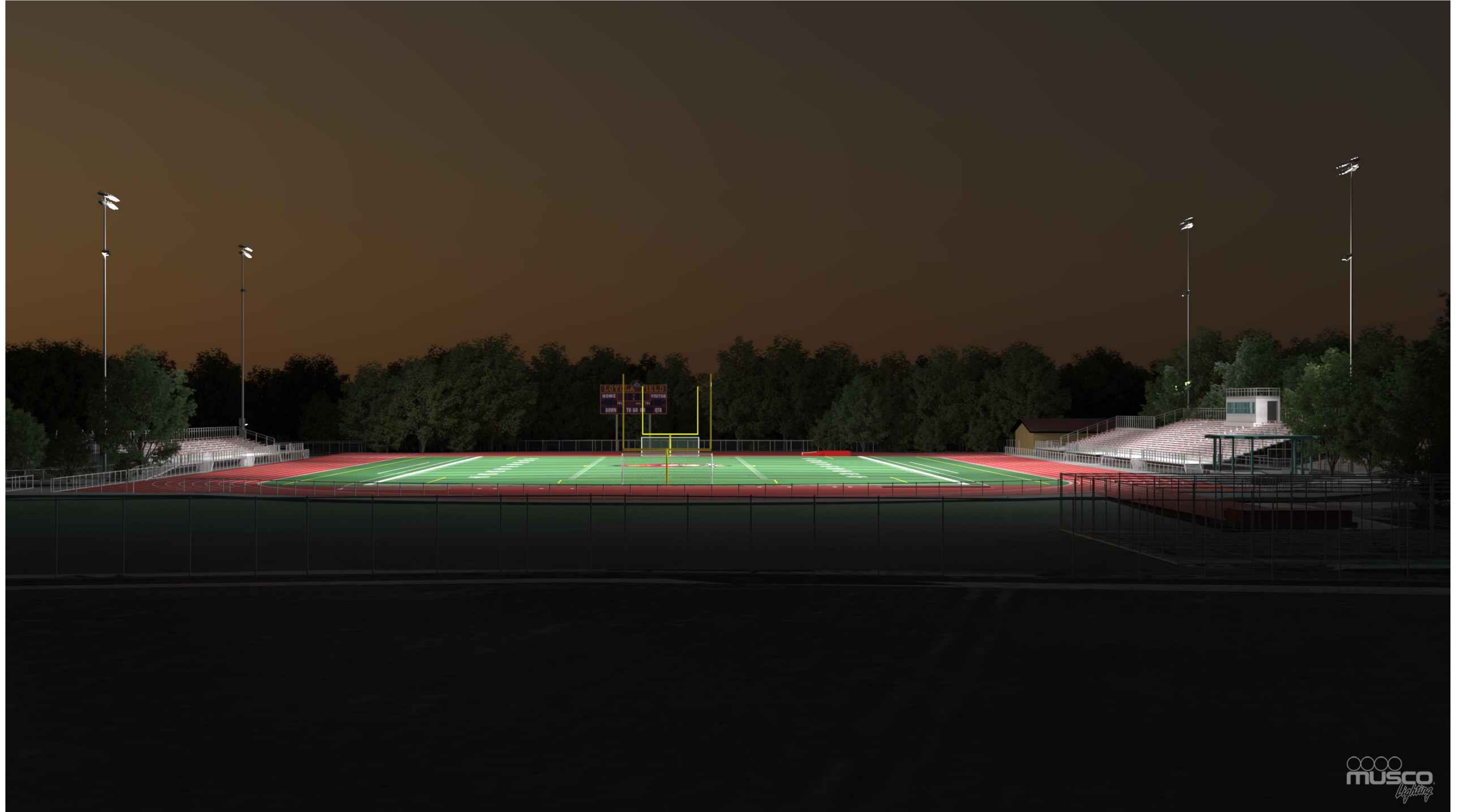
(D) VIEW FROM SCHOOL TOWARDS STADIUM (FROM BASEBALL FIELD)

DRAWING NAME: C:\Users\station27\AppData\Local\Temp\AcPublish_13804\_MUSCO.dwg PLOT DATE: 03-03-22 PLOTTED BY: station27