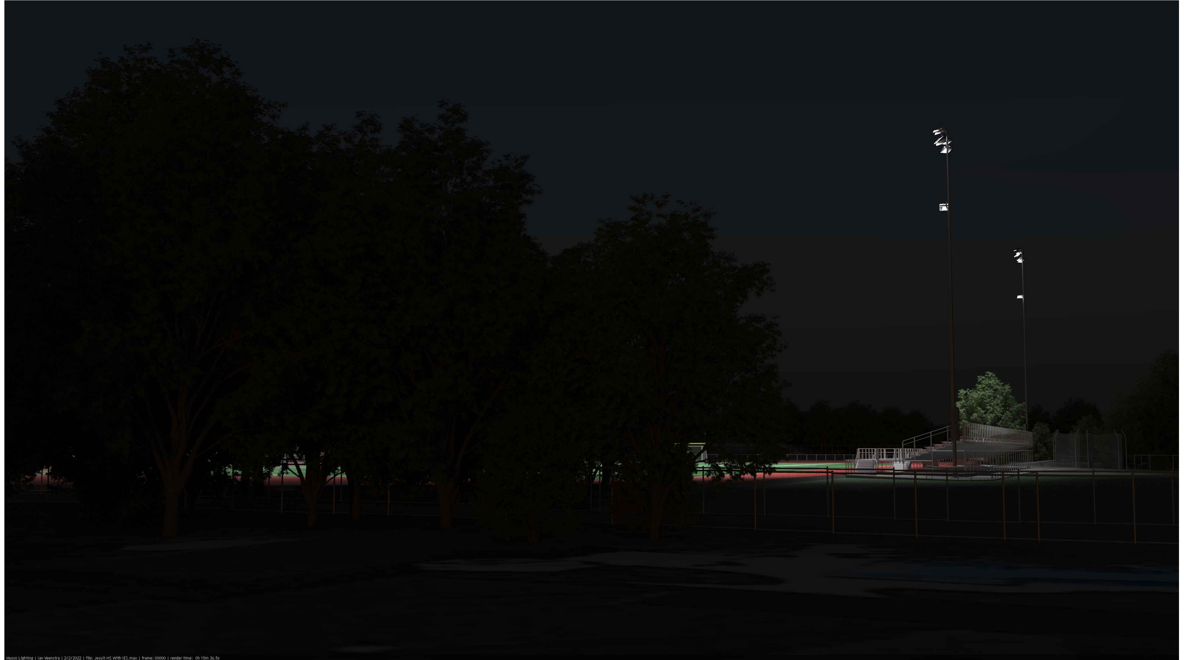
(F) VIEW FROM ADJACENT PROPERTIES TOWARD STADIUM - 1

VERDE DESIGN LANDSCAPE ARCHITECTURE CIVIL ENGINEERING SPORT PLANNING & DESIGN