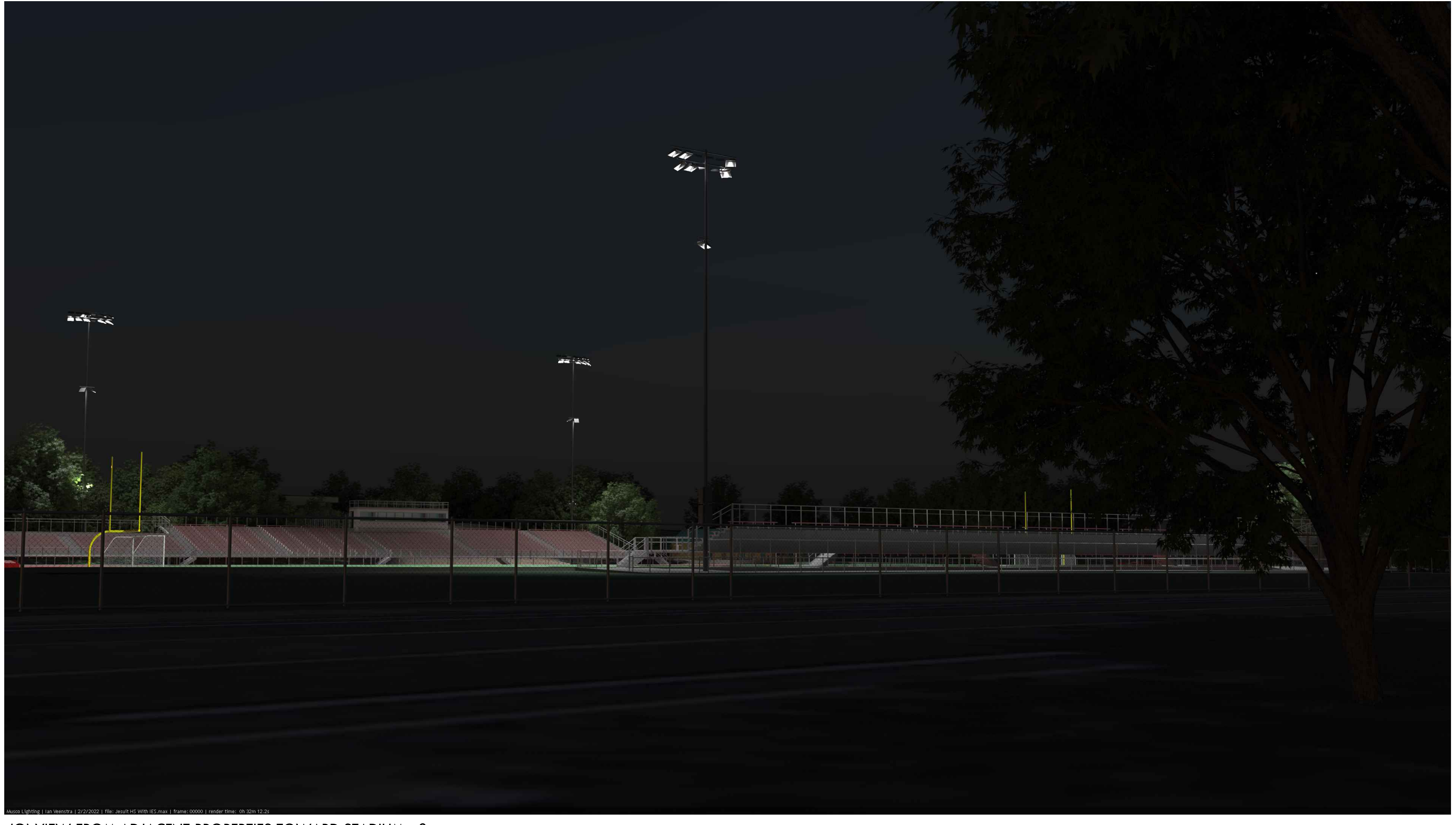
(G) VIEW FROM ADJACENT PROPERTIES TOWARD STADIUM - 2